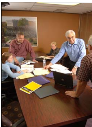
Business students gather at Olivet Nazarene University.

The degree is just one of the new features of Business programs offered through the School of Graduate and Continuing Studies: