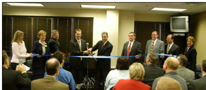
Indiana Wesleyan University dedicates an Education Center in Lexington, KY, on February 22, 2006.

Enrollment necessitates a second site in Cleveland, OH. A recent Ohio Board of Regents site visit verified that the University excels in meeting the needs of the adult population. The new, roughly 10,000-square-foot location will work under the direction of the staff at the current Cleveland Education Center but will