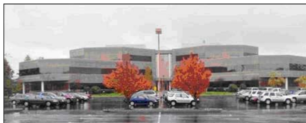
The second Cleveland Education Center will host classes in May.

be located on the east side of Cleveland. The new site will be located off the interstate in Cleveland and will house five classrooms, a computer lab, study rooms, and a student lounge. The build out of the space should be complete by the beginning of April, with classes starting in May.